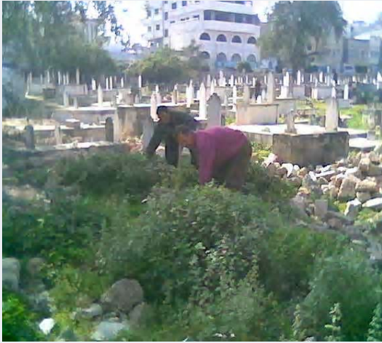
Cleaning the Cemetery in Gaza City