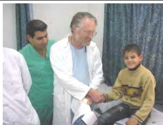
An Australian doctor meets a child in Gaza

patients were assisted (41 were children) with complicated medical procedures. By bringing these doctors to Gaza and doing these surgeries there, the cost savings were huge. In addition, there would be no guarantee that the patients could ever even leave Gaza anyway. Caritas Jerusalem contributed directly to 20 of the surgical interventions through the SOA 9 2006 program.