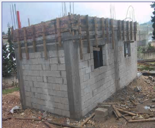
Completed shell of the new sanitary unit for the Jalboun Secondary school.