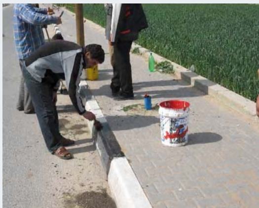
Al Qara project in Gaza - Painting pavements and cleaning roads.