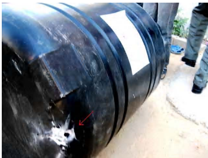
The above photo is from one of the damaged water tanks that Caritas Jerusalem was distributing to needy families in the Al Faraheen area of Khan Younis.

What we are seeing there is a disintegration of the social order and a return to tribal thinking and systems of justice. Safety is becoming more of an issue today.