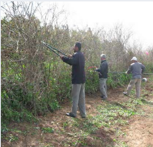
Cash for Work in Beit Hanoun