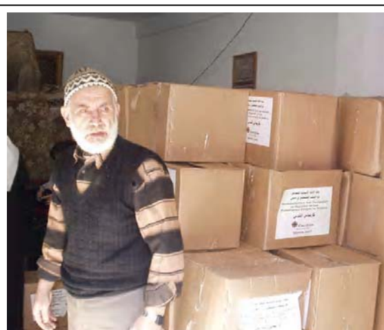
Humanitarian goods for Nablus

Caritas Jerusalem has sent a humanitarian donation of 200 food parcels to poor families in the Old City of Nablus at the beginning of March. This donation came due to the very bad situation there following one of the worst incursions into Nablus in the last three years.