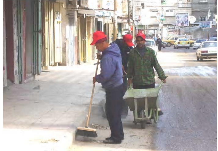
Workers cleaning roads in Khan Younis in the Southern Gaza Strip.