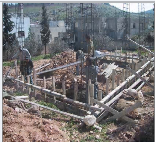
Construction work on the Jalboun Secondary School Sanitary Unit