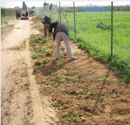
Cash for Work in Beit Hanoun