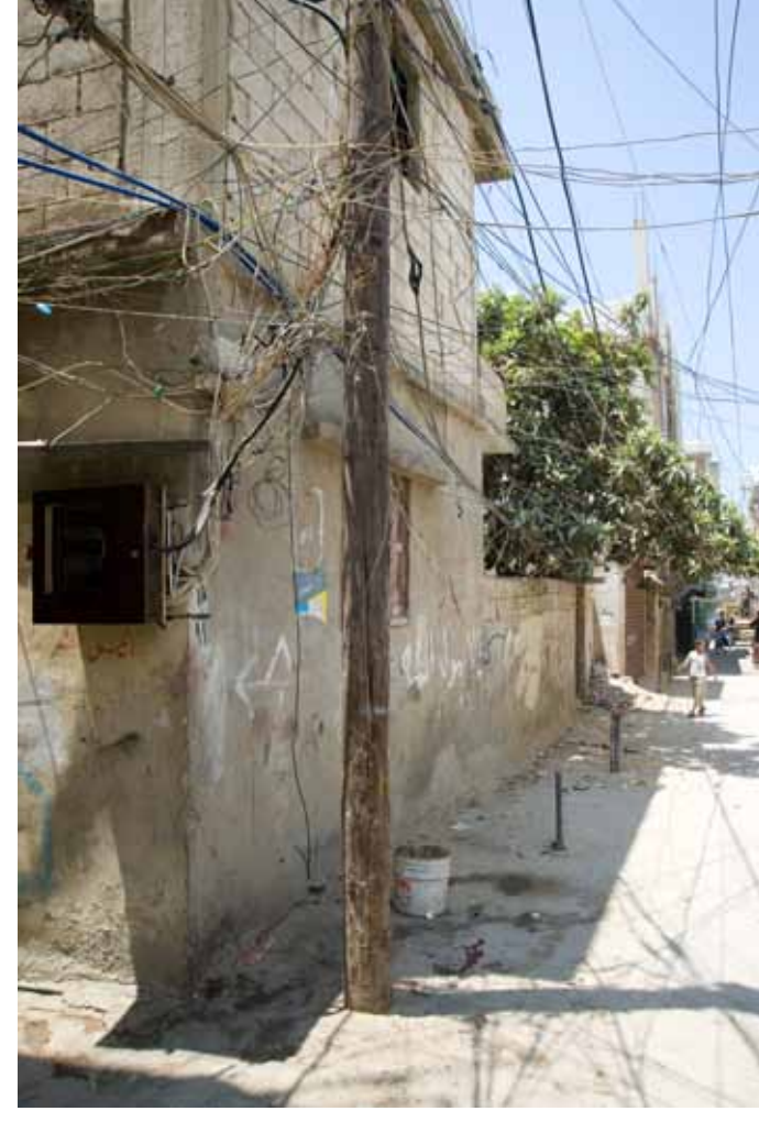
These narrow mazes of paths and low hanging wires overhead in Ein El Helweh are ubiquitous to every camp in Lebanon.