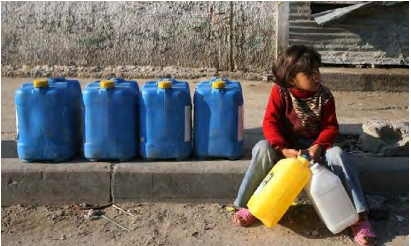
A Palestinian girl takes a rest on her way to collect drinking water in Gaza, where more than 90 per cent of the water available is polluted and unfit for human consumption.