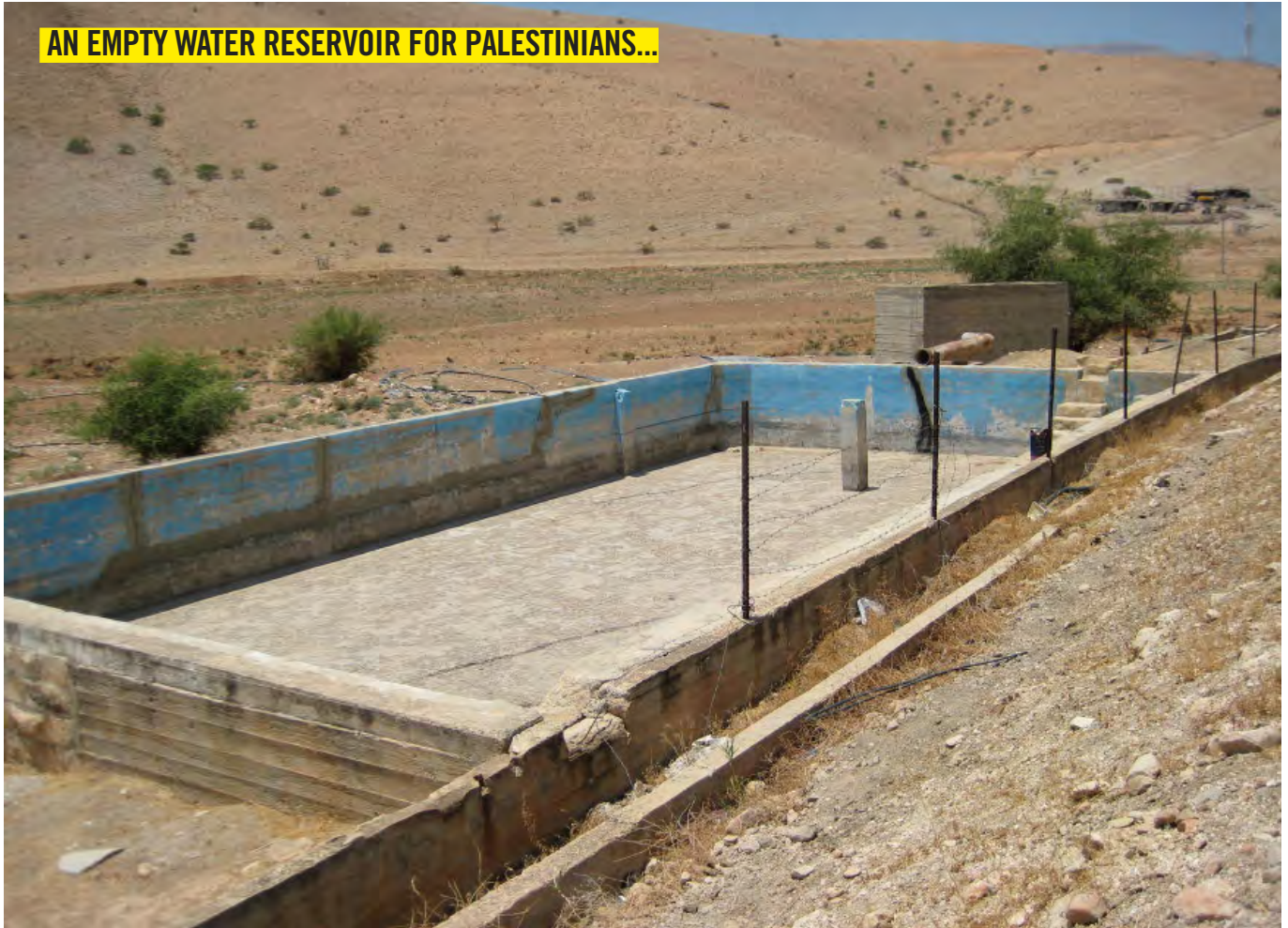
AN EMPTY WATER RESERVOIR FOR PALESTINIANS...